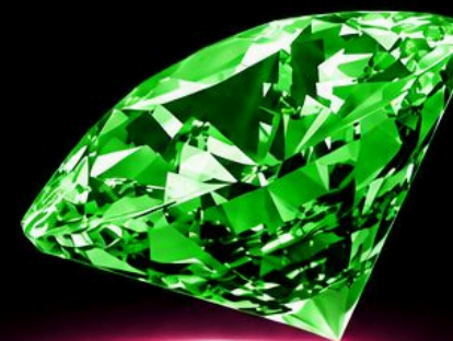
Medical Micropigmentation Technician