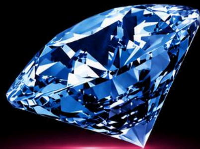
Skin Needling 3-1 Technician